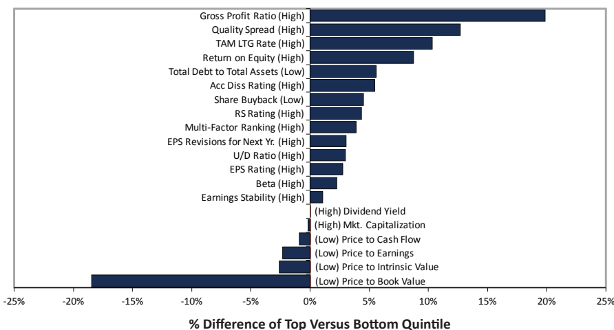
S&P 500 Index Universe: Best-Worst Performers for Twelve Months ending 9/30/2018

1 Assets Under Administration (UMA Assets) are as of 6/30/2018 and are not included in Assets Under Management as Todd Asset Management does not have discretion over the accounts, nor does Todd Asset Management arrange for or effect the purchase or sale of model securities for the client.